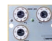
P-controller RPP 20

The measuring element generates a force that changes in proportion to the measured value. A highly sensitive bleed-off force-balance system converts this force into a linear standard pressure signal which is forwarded to the controller.