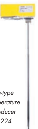
Stem-type temperature transducer TUP 224