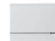
Room-temperature transducer TSUP 224