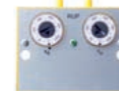
Differential pressure controller/transducer RUP 105